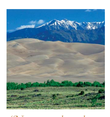
"No matter how the financial landscape may change, GCM keeps you on course and moving forward."