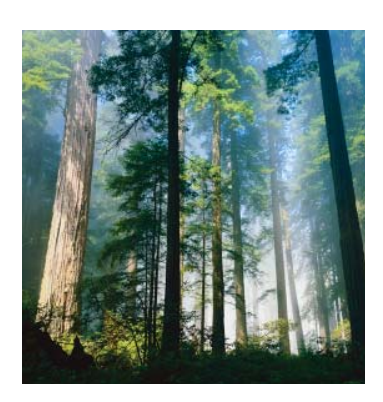
"GCM provides clear and steady direction, even

The Personal Investment Plan (PIP) is a clear and comprehensive blueprint for the enhancement and safeguarding of your investment assets. It may also include strategies for inter-generational, estate, and trust planning, as well as for charitable gift-giving and other philanthropic endeavors. The development, implementation and monitoring of a PIP is outlined in the following phases: