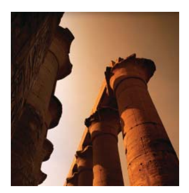
"Objectivity and diplomacy are key in matters of Trust..."

Through a conservative fixed-income approach, GCM strives to build the financial resources that non-profit clients need to maintain and improve programs, staff and infrastructure. GCM offers a competitive fee schedule to further support its clients' endeavors.