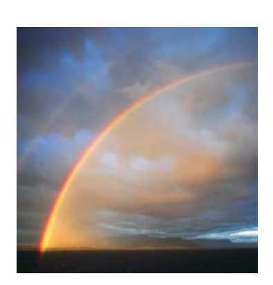
"Their approach is proactive, not reactive to the ups and downs of the market..."

GCM takes a decidedly different approach. Our limited client base allows for highly individualized attention that emphasizes continuity in service.